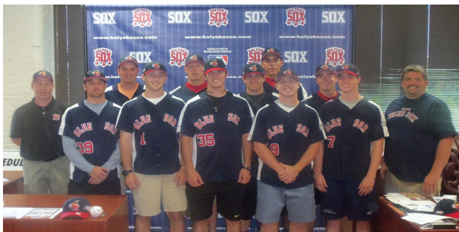
2011 Holyoke Blue Sox first team picture at the Holyoke Blue Sox Headquarters on Saturday as the players started arriving in Holyoke.